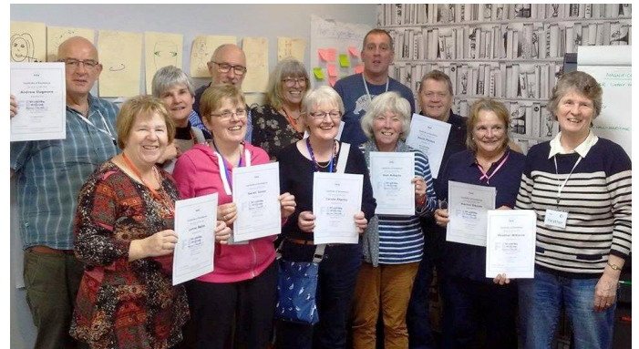
Photo: Wales Official Tourist Guide Association Blue Badge Guides trained by FEG as trainers

We are delighted that “new blood” for the FEG training team has stepped in, able to fluently train tourist guides in English, French, Italian, Greek, and Portuguese. Most of them also have valuable additional degrees and skills from their previous studies and jobs. Looking forward to more of the FEG Trainers-In-Accreditation being assessed next.