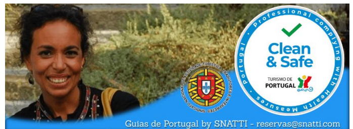
New Turismo de Portugal & SNATTI “Clean & Safe” webinar and certification for qualified tourist guides

We remind you all that your news, and photos or videos always have to be written or recorded in English (or at least with English subtitles) and should be sent via your associations to fegtouristguides@gmail.com for our marketing team to upload, schedule and promote.